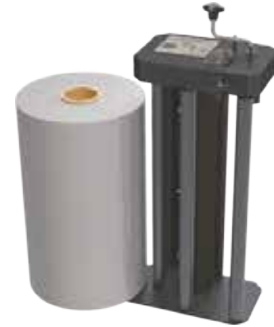
MECHANICAL BRAKE SYSTEM