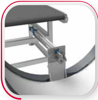
Stretch Film Cutting Unit

The machine is equipped with improved component that allow the machine to work accurately, without failure and for a long time.