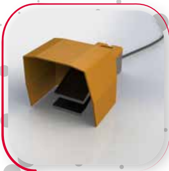
Foot Pedal Switch