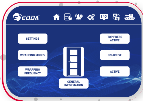
HMI Touch Panel