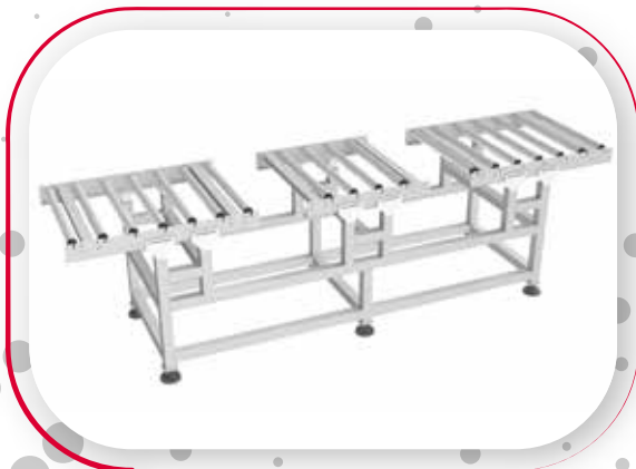
Fork - Lift Reel Table