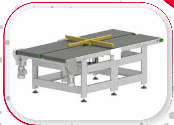
Cross Rotation Lifter Motorized Conveyor