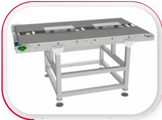
Pneumatic Lifter Conveyor