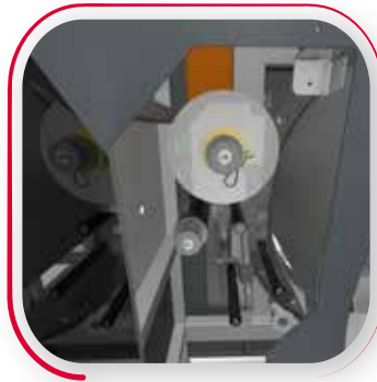
Stretch Film Carriage Unit