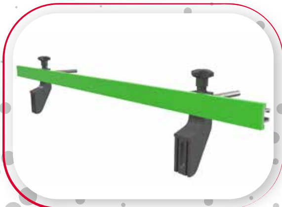
Manuel Side Guide