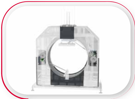
Double stretch film cartridge