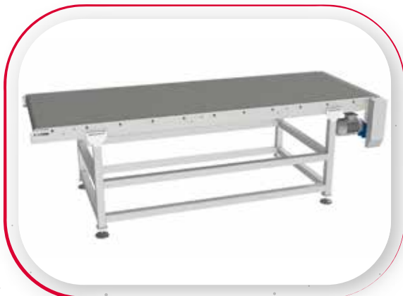
Different Length Motorized Conveyor