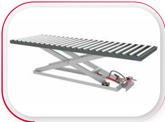
Scissor Lift Roller Table