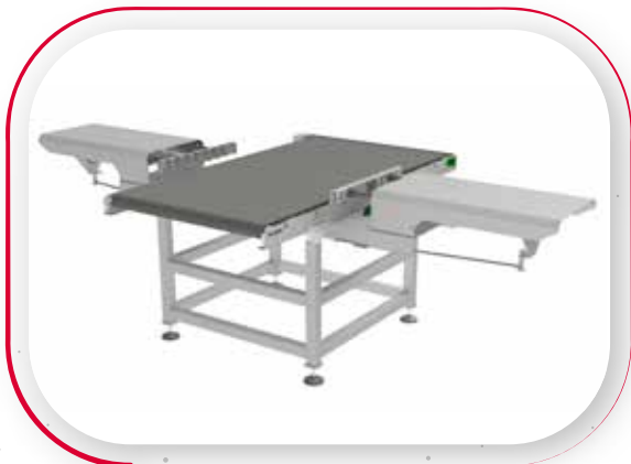
Automatic Centering Side Press