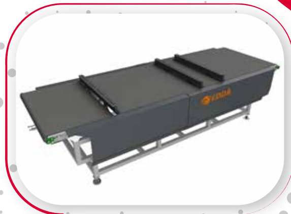
Parallel Lifter Motorized Conveyor