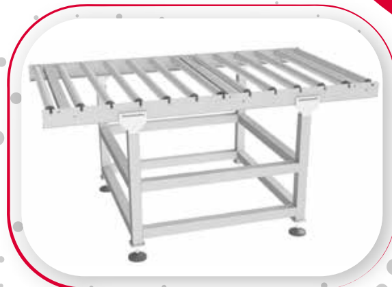
Non - Motorized Reel Conveyor