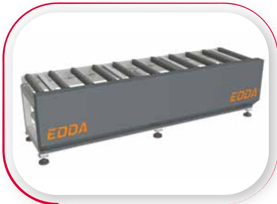
Heavy Duty Roller Conveyor Motorized / Non - motorized

Some useful optional equipment. You can search for more with us.